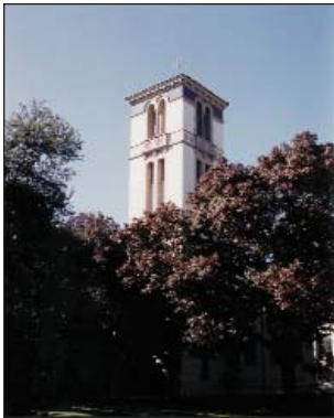
2720 S. University Dr. Ft. Worth, TX 76109